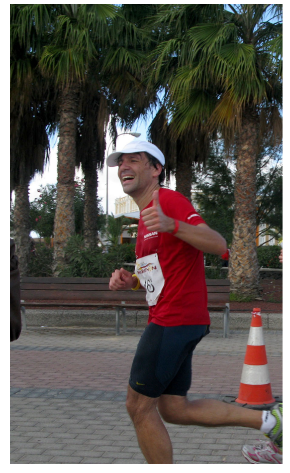
Figure 2. Celso Arango participating in the Lanzarote International Half Marathon on the Island of Lanzarote, Canary Islands, Spain. Amidst the iconic palm trees of the island, Dr. Arango is captured in full stride, flashing a bright smile and a thumbs-up to onlookers. His enthusiastic engagement in this challenging event reflects the energy and determination he brings to his pioneering work in psychiatry. The vibrant island setting provides a striking contrast to Dr. Arango's usual clinical environment, highlighting his ability to balance rigorous professional pursuits with an active lifestyle.

and first psychotic episodes, primarily in child and adolescent populations. I then became interested in secondary prevention of psychosis, followed by research into prodromal stages and risk factors for psychosis. Currently, I am focused on primary prevention of mental disorders, exploring universal, selective, and indicated primary prevention strategies.